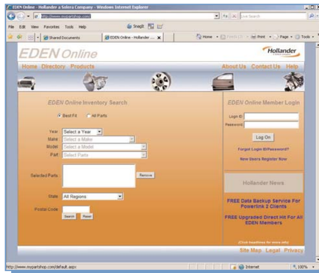
EDEN ONLINE WWW.MYPARTSHOP.COM

Allows you to search parts inventory from your own website—regardless of where it is hosted—and do multiple part lookups while providing an expanded results display (year, model and mileage)